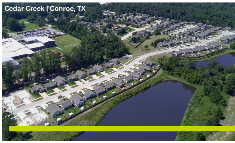
Cedar Creek | Conroe, TX